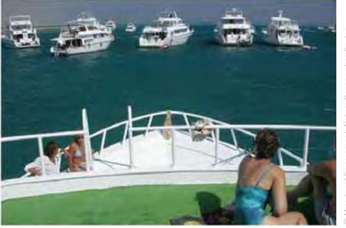
nistry of Environment, I