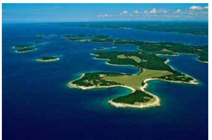
Brijuni National Park

The beneficiaries are the local communities (especially economic operators) and the Park managing body. Benefits are shared according to tourism offers. Financial incomes increase local support, and allow the Park management body to finance conservation actions. One of the key components of this project is the high "profitability" rate generated by ecotourism: the ecotourist does not look for luxurious hotels but is ready to spend a lot of money to have real "nature experiences".