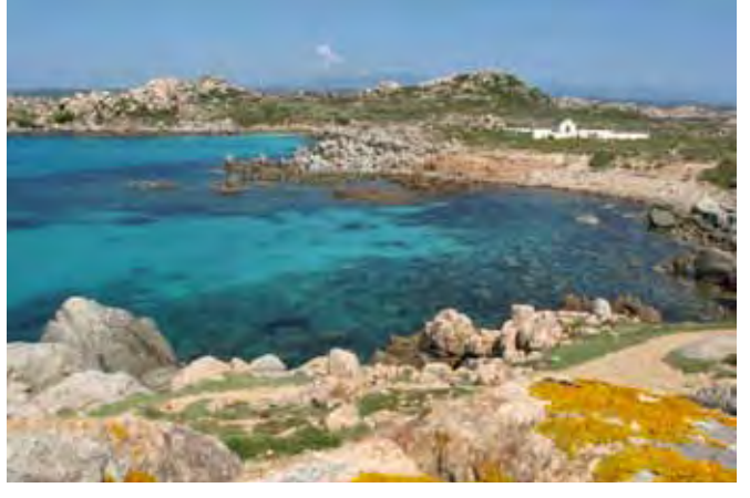
AMICLA_Claudia Amico/ WWF Can