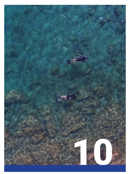
Views from the field