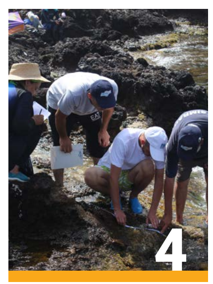
EcAp MED III