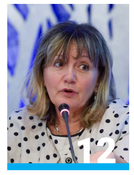
A word from the UNEP/MAP Coordinator