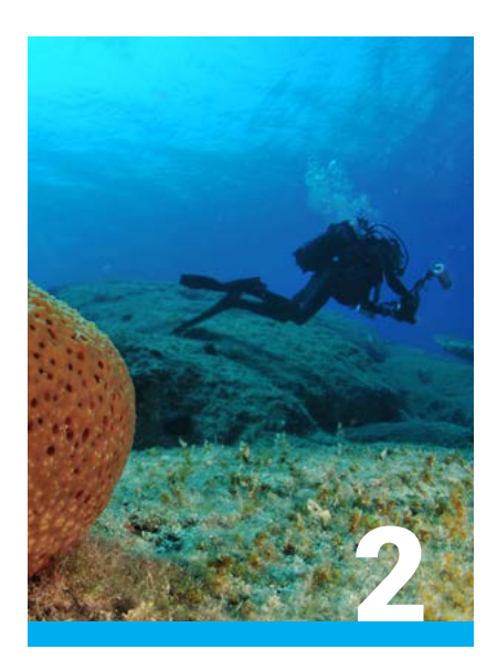
A push for the achievement of Good Environmental Status in the Mediterranean