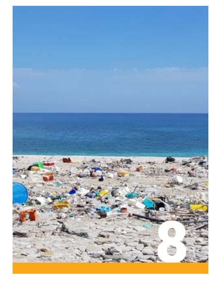
Marine Litter MED II