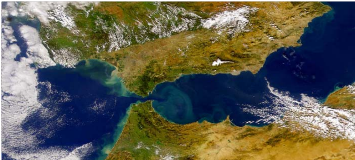
Fig. 1. Alboran basin and adjacent Atlantic (west) and Mediterranean (east) waters.

The oceanographic dynamics of the Alboran Sea is highly influenced by the exchange of waters between the Mediterranean and the Atlantic, which is constrained by the Straits of Gibraltar (14 km wide) in the west end. The oceanography is also influenced by the topography of the basin, with predominantly narrow continental shelves and a moderately deep seabed, down to 2000 m. Sparse seamounts and submarine ridges, most of them of volcanic origin, complete the picture.