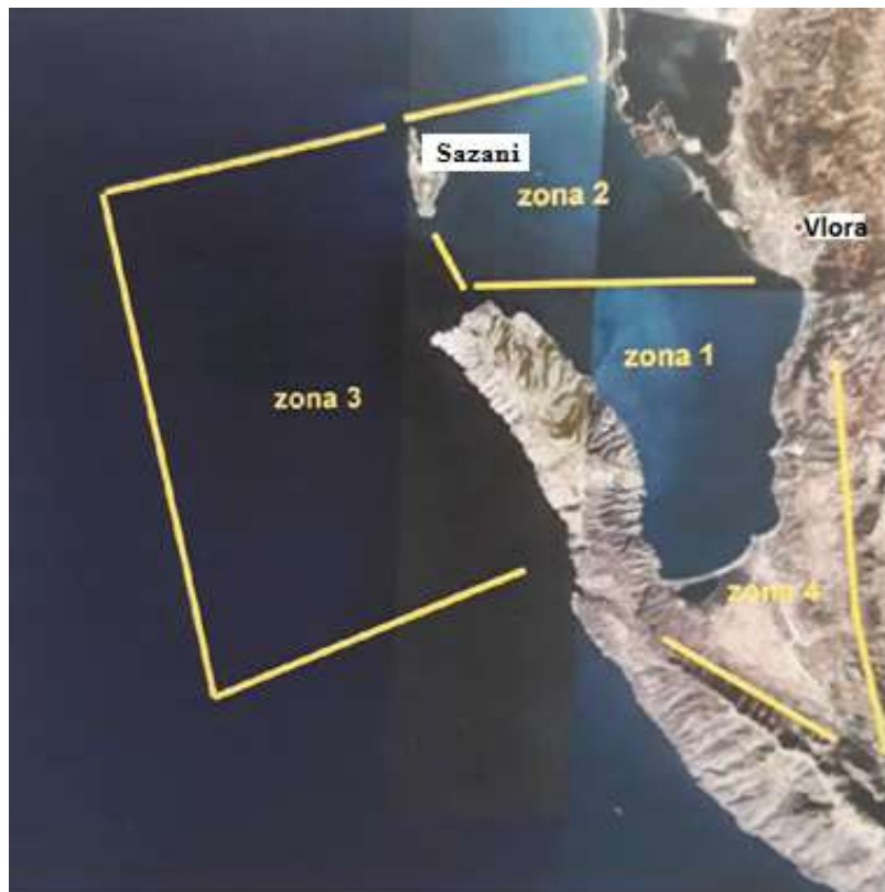
Figure 5: Study area CIZM project, 2007-2008

The results of these works were presented in two documents (789 pages and 245 pages) which should be consulted within the present study.