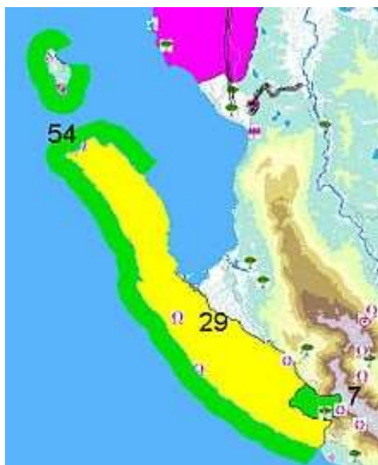
Figure 3: Coverage area (in green) of the Karaburun-Sazan marine park

In the Albanian waters and, in particular, in the Vlora Gulf, various natural and anthropogenic impacts have been acting progressively in recent years. In fact, development for tourism and its consequent building activity have increased the variation in transported sediment volume and in the evolution and shifting of river outlets, with negative effects on both sediment dynamics and the morphologic equilibrium along the littoral zone, especially in dune system (Boi, 1994; Anonymous, 2008). In addition, the building of the New Vlora harbor in Albania has also acted on the coastal dynamics, increasing coastal erosion and moving a lot of the sediment and debris on the bottom of Vlora Gulf. Moreover, natural sediment transport from the Vjosa River is high (estimated at about 8 million tons per year), and there is transport from other minor sources as well. Studies on the currents and water-mass dynamic inside the Vlora Gulf have highlighted the presence of two whirlpools in the center and southern parts, leading to further massive transport of fine sediment deposits. All these processes are responsible for intense sedimentation within the soft-bottom communities, which could affect their structure and equilibrium.