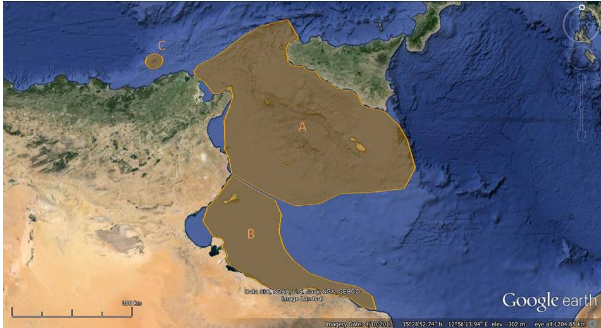
Fig. 3. Satellite view of the study area (Sicily Channel – Tunisian Plateau), showing the Important Areas for the conservation of seabirds proposed – A: Cap Bon – Strait of Sicily – Malta, B: Gulf of Gabès – Gulf of Tripoli; C: Galite Archipelago.