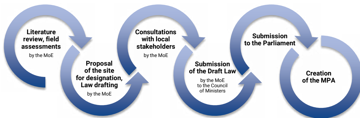
Figure 1: The process for the creation of Nature Reserves