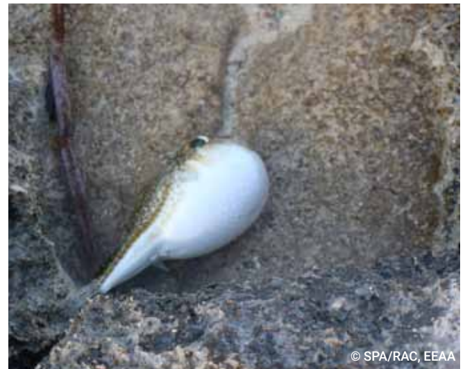
Figure 10. Some of the threats facing the Salloum MPA (plastic pollution, invasive species).