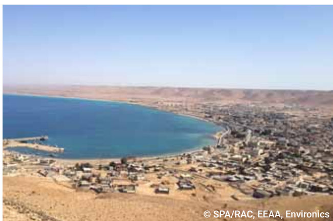
Figure 3. The Salloum Marine Protected area.

Salloum MPA was declared in the 27 th of February 2010 as the first MPA on the Mediterranean side of Egypt, in accordance to the Egyptian law for natural protectorates (102/1983) by prime ministerial decree no.533/2010 upon the request of the minister of Environment. The declared area was 383 Km 2 , which was less than what was proposed, where, the western side was not included due to security reasons. The protected area is mainly offshore with coastal area covering the first 500 m of the coast along 45 km on coastline.