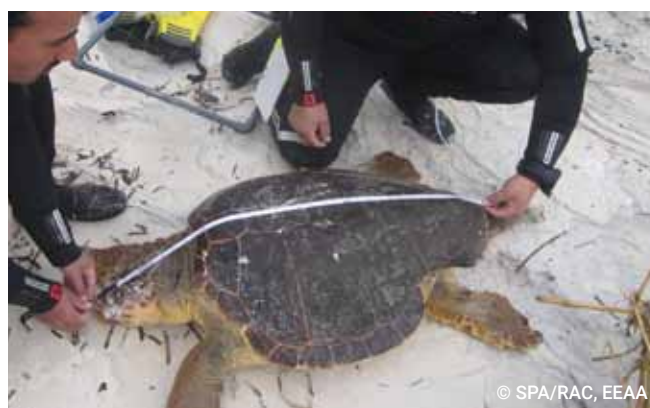
Figure 4. Skull of dolphin and loggerhead turtle found during the assignment.