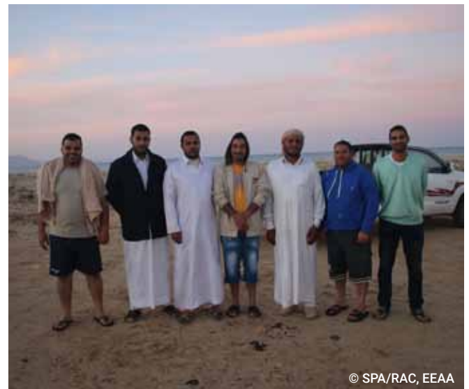
Figure 1. Some of the member team who participated in the assignment.