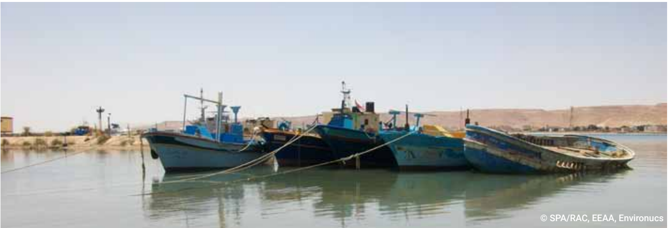
Figure 8. Traditional boats used for fishing in Salloum MPA.

Hunting of migratory birds is a seasonal hobby/ practice basically, not just for livelihood. The migratory birds hunting season extends between June and September. However, there are some of local community catches