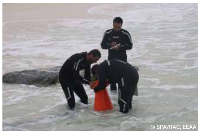
Figure 2. Snorkelling and coastal surveys during the assignment.