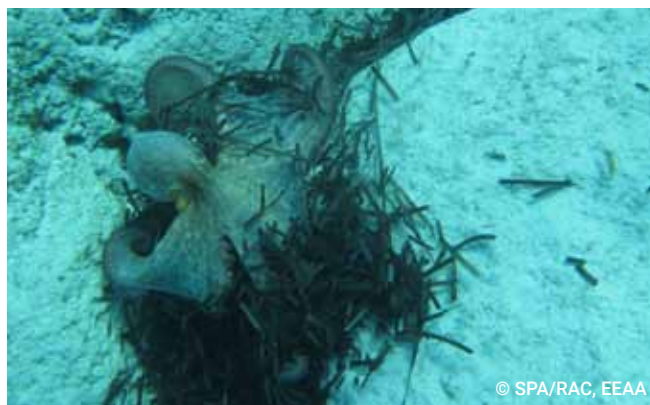
Figure 5. Photo of Octopus sp. captured in El Garah area.

This diversity varied in many studies that reviewed in according with the timing and location of the study and the survey method (included in the Annexes).