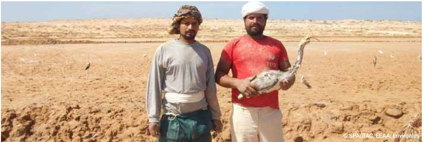
Figure 9. Artificial birds used to trick migrants birds.

birds to gain extra income, when they sell what they caught, especially quail. There are also very few who trade in the rare species of falcons to Arab Gulf princes with a lot of money.