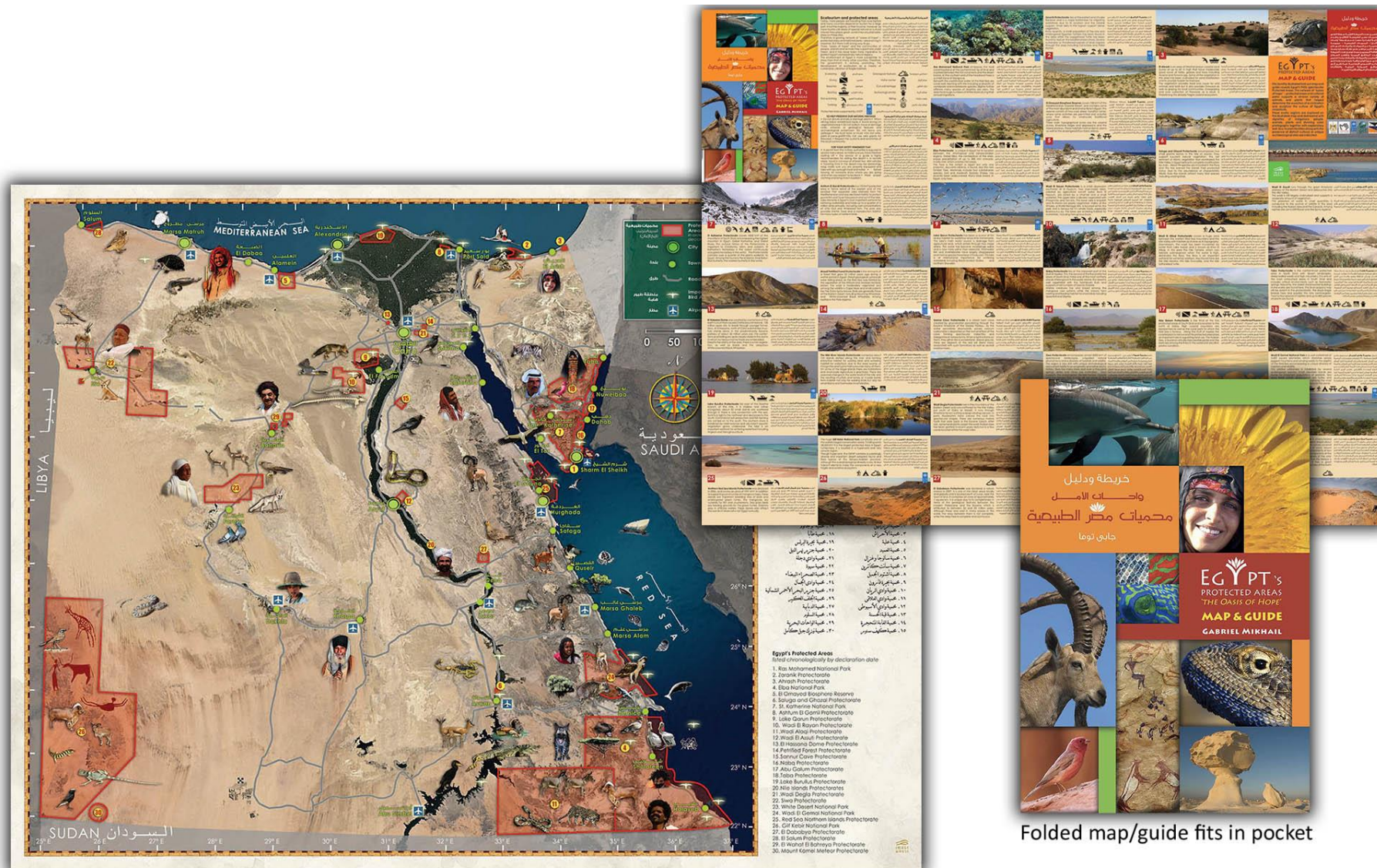
Folded map/guide fits in pocket